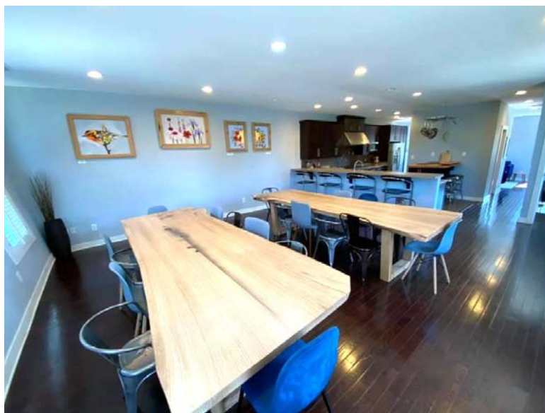
click the image to view more

Accessible through a private, street-level door and staircase, the reception + dining area and open-concept kitchen also features a private cocktail lounge and restroom. This fully independent space is carefully cleaned and sanitized between guests. With flexible rental arrangements and optional food + drink service, this spacious and welcoming setting is ideal for private events.